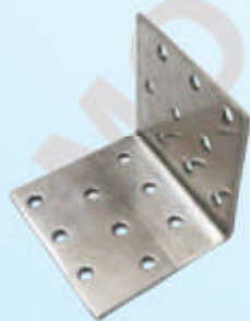
MSO-CORNER JOINT PLATE