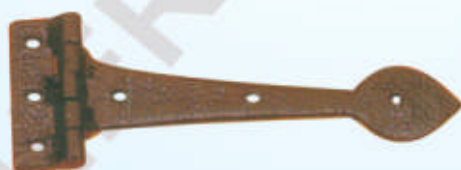
MSO-CAST IRON HINGE