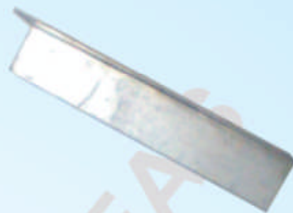
MSO-WALL / ANGLE CHANNEL